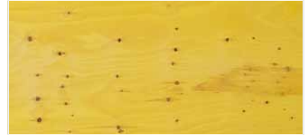
Admitting open defects