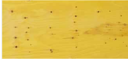
Admitting open defects